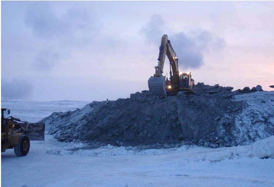
Photo 1: 345 excavator digging into frozen stockpile of FCM at FCP Plant Pad.