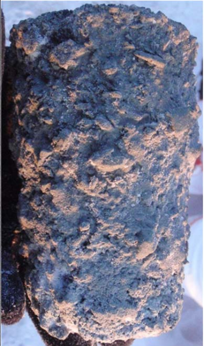
Photo 12 (center left): DC2 taken at 0+86, near centerline. The use of additional glycol was used in DC3 in increase recovered