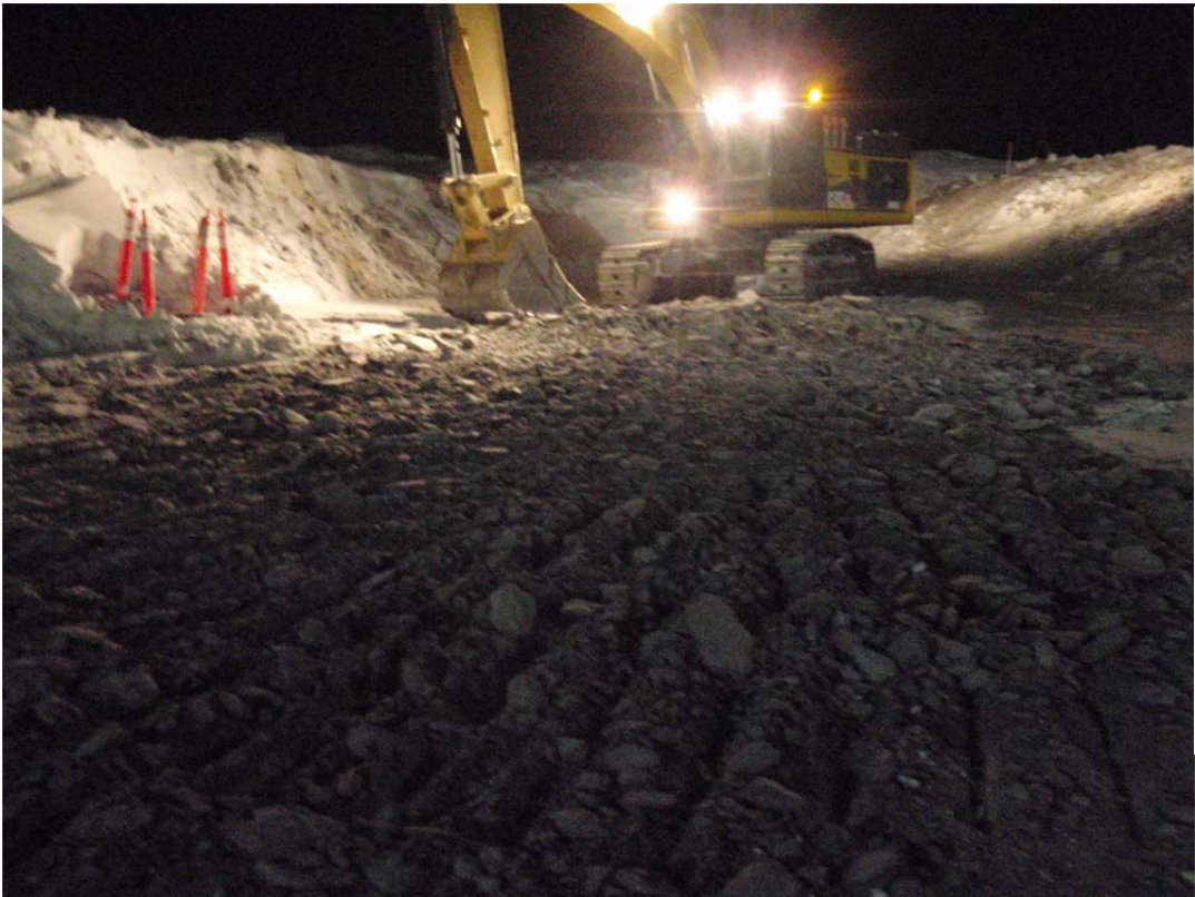
Photo 4: 345 excavator (with toothed bucket) ripping up frozen 5/8" material near station 1+70.