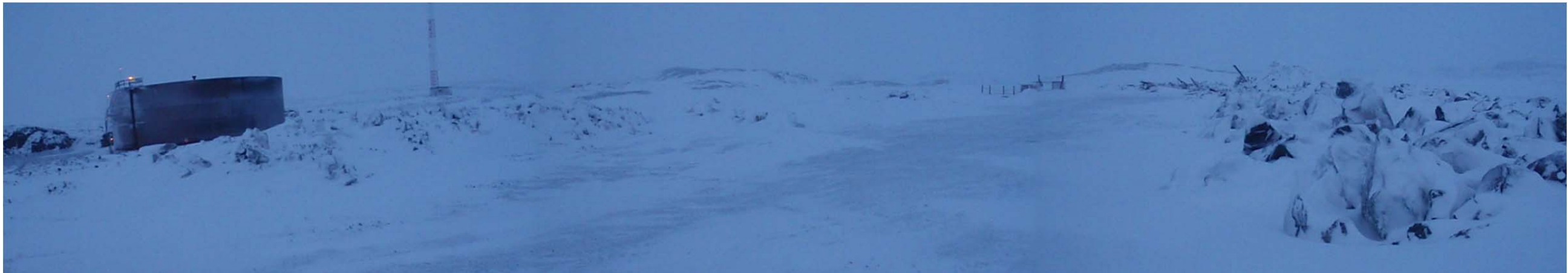
Photo 6: ~ NE view from the Roberts Bay Overburden dump towards the Quarry #1 Tank Farm.