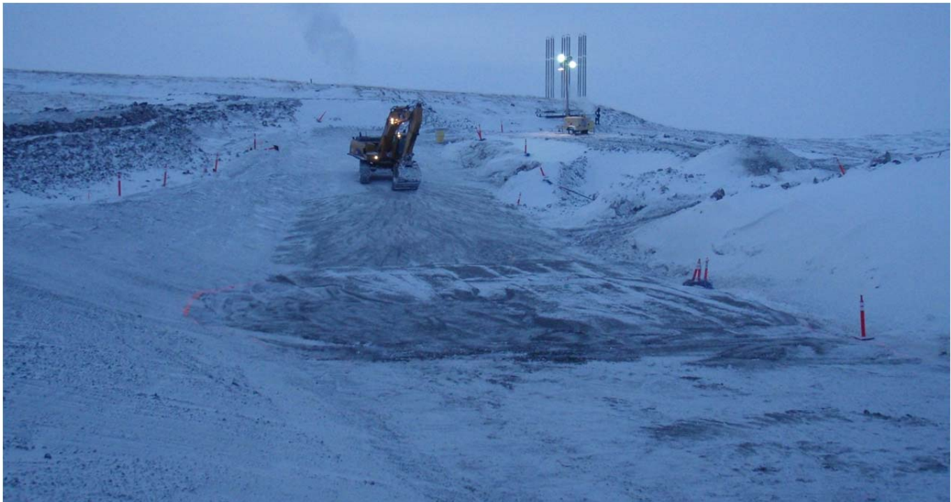
Photo 3: ~W view of 330 excavator scraping down 5/8" material in the key trench. Note the excavator is cleaning around station 0+50 in this photo.