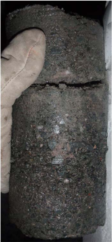
Photo 13 (center right): DC3 taken at 0+97 on the downstream. Taken at the edge of the lift placed on 2012/01/17.