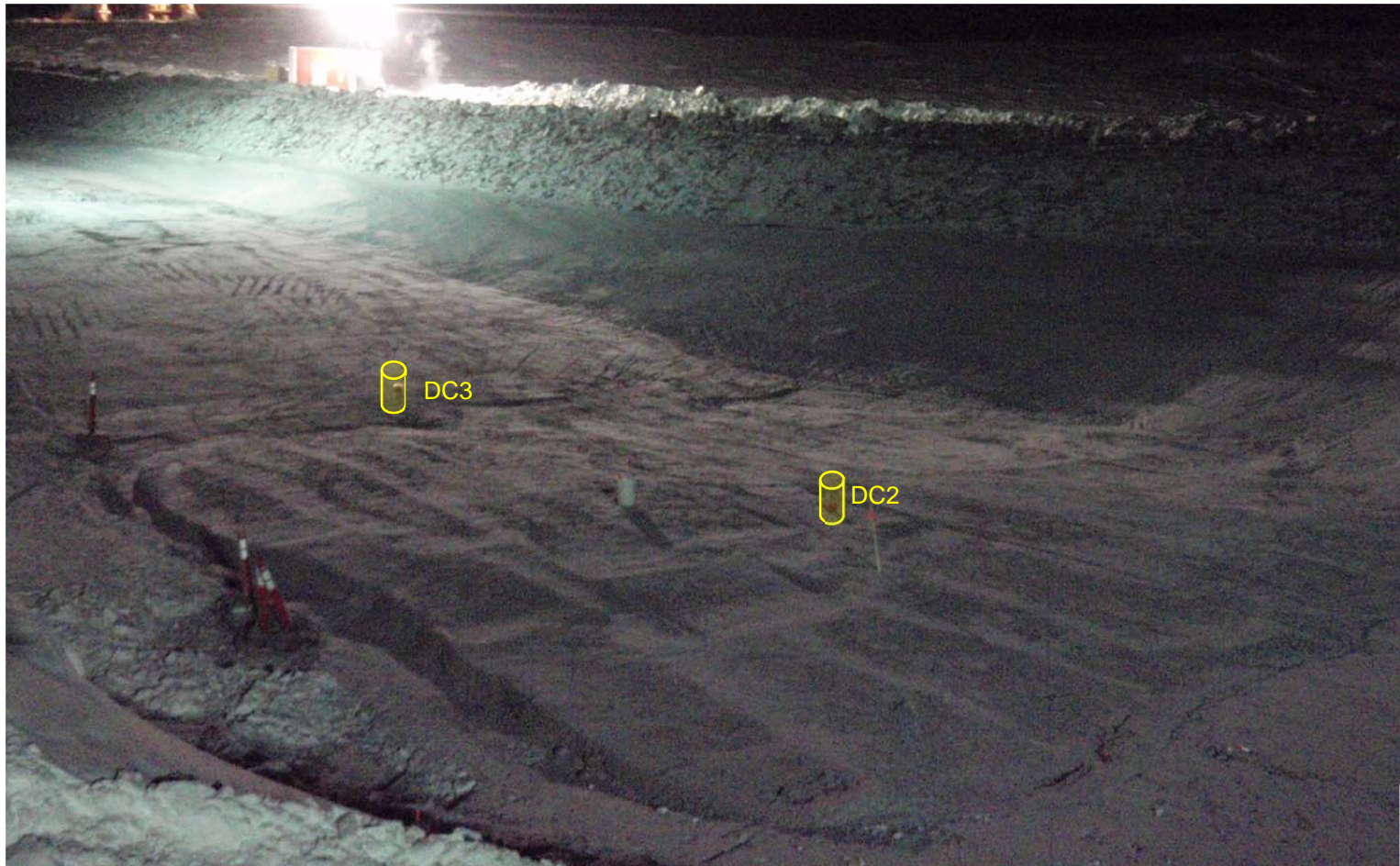
Photo 11: ~SEE view of key trench locations what were cored today. Note that the yellow cylinders mark the ~ locations that cores were drilled from.