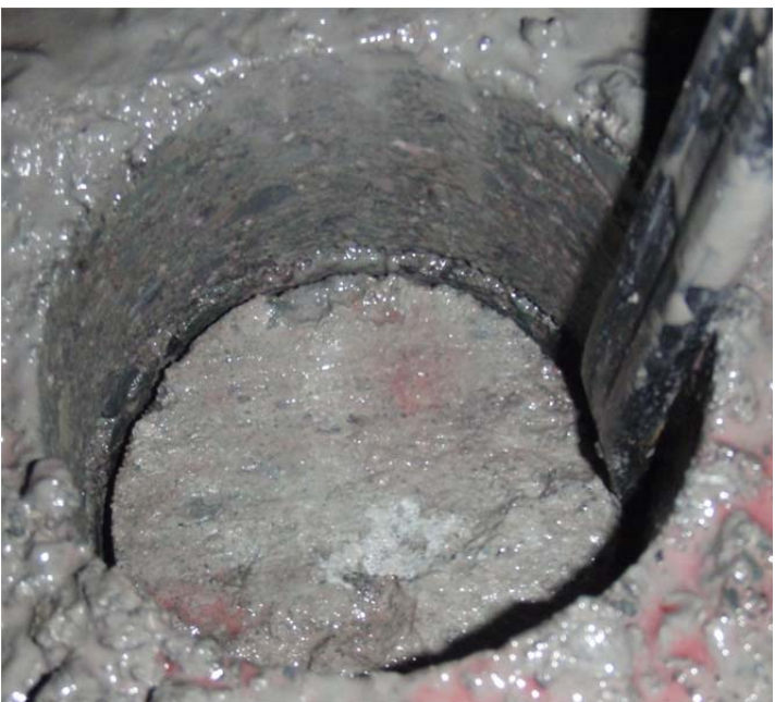
Photo 14: View at the location of drilled core 2. Note the interface connection noted between the recent lift and 2011 FCM at this location. Note that this area is near the edge of the lift placed on 2012/01/17. Bonding between layers is expected to be better in the areas where a larger mass/ volume of core material were placed. Additional cores to be taken in the coming days to better investigate bonding between lifts.